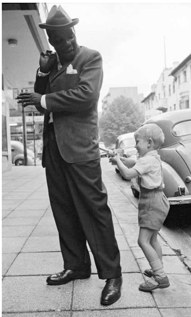
David Goldblatt , Holdup in Hillbrow, Johannesburg, November 1963 , Silver gelatin photograph on fibre-based paper, Edition of 10, 40x30cm, © David Goldblatt.

simply a tool to illustrate the beauty of cover girls, it was transformed into a political vehicle through which it mobilized the masses into forcing the government into a public enquiry.