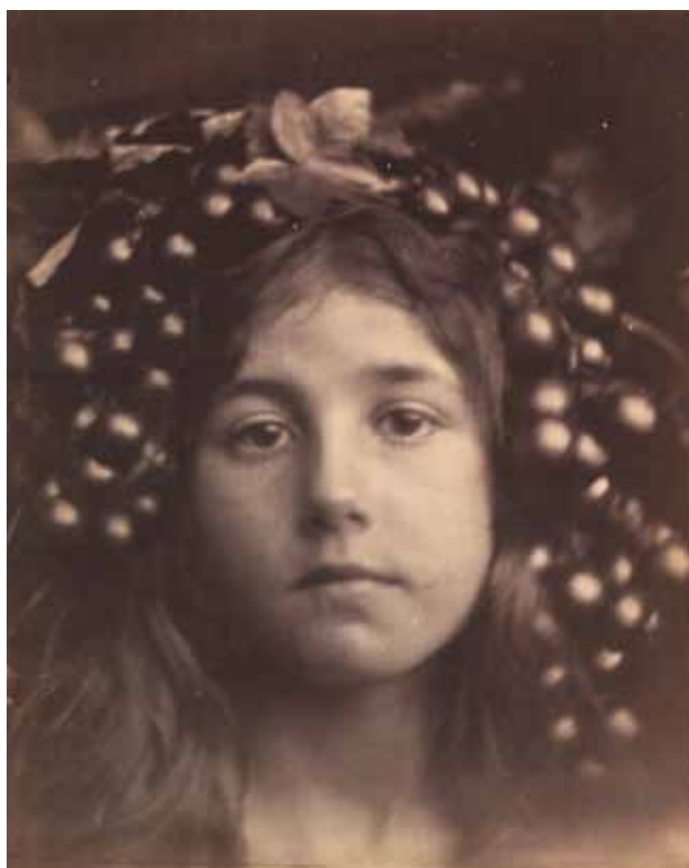
Julia Margaret Cameron (1815-79), Circe, c. 1865