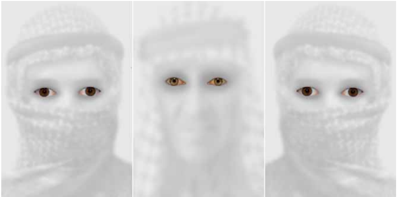
Halim Al-Karim , Witness From Baghdad 1 , 2008, Lambda print, 150 x 300 cm, Triptych, 1/2 AP - Courtesy of XVA Gallery Dubai.

is a small bunch of exceptional photographers whose art is so easy to spot and is thus recognised by various establishments, from leading art historians and curators to international awards.