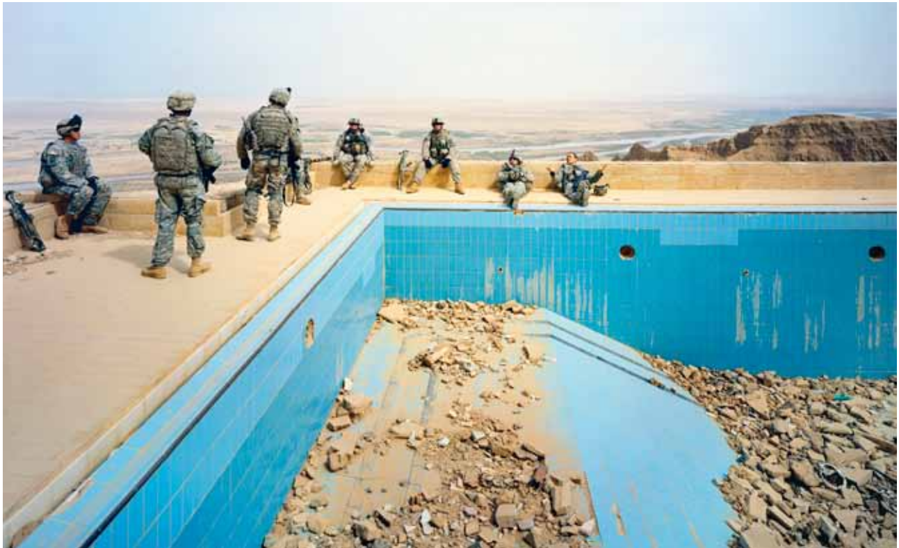
Richard Mosse , Pool at Uday , The Spectacle of War series, 2009, Digital C-type, face mounted to plexi, mount on dibond, Edition: of 2, 72x96inches - Courtesy of The Empty Quarter Gallery, Dubai.

identity, history, race, representation and sexuality. Like Youssef Nabil, Moffatt is also interested in the phenomenon of celebrity culture, often glamorizing her subjects. War, destruction and toil are one of Richard Mosse's concerns, his images represented a 'carnavalesque' reversal of Saddam Hussein's era of extraordinary extravagance and luxurious lavishness, where American soldiers are depicted sunbathing around Uday's pool, which is filled with rubble. There is a comic turning-on-its-head element to Mosse's image; water and life are replaced with a wasteland of rubble, and, in exchange for Uday's prolific heap of women, we now have American Troops