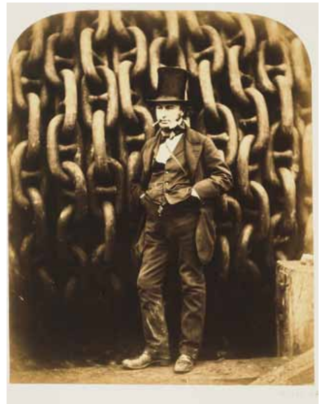
Robert Howlett, Isambard Kingdom Brunel, Courtesy of V&A Images

In the West however, photography began as an anthropological tool. As argued by Geoffrey Batchen, photography began as a ‘means of grasping and fixing social position from within the turbulent flow of social change’. I purport that the intent was not just simply